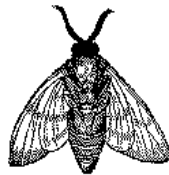
Figure 2: A sample black and white graphic (.pdf format) that has been resized with the includegraphics command.

As was the case with tables, you may want a figure that spans two columns. To do this, and still to ensure proper “floating” placement of tables, use the environment figure* to enclose the figure and its caption.